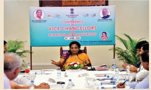
Governor addressing the gathering