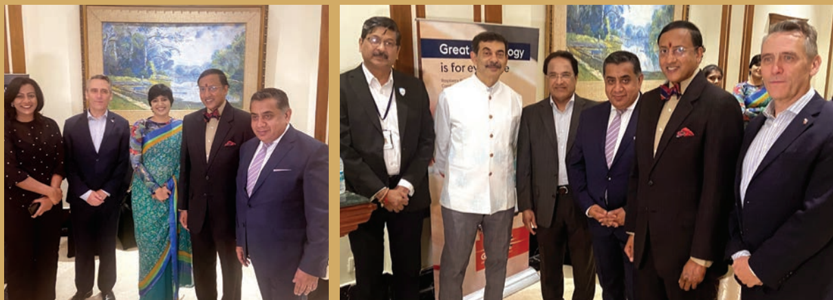
Dr Raghu Ram was invited by British deputy high commission to meet with Lord Tariq Ahmad of Wimbledon (UK minister of state for the Middle East, south Asia and United Nations) on May 30 in Hyderabad. The minister was on a four-day visit to India focusing on strengthening collaboration in areas of science and technology