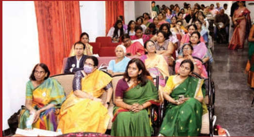
Creating awareness about breast cancer