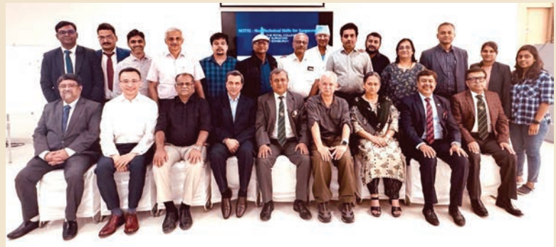
The faculty with participants