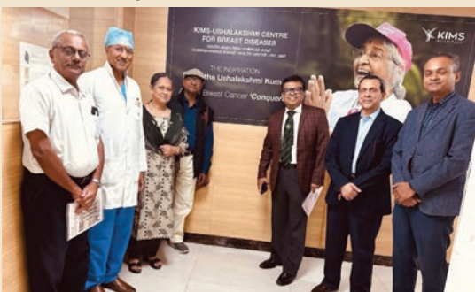
Some of the faculty members at KIMS-USHALAKSHMI Centre for Breast Diseases

It is a follow up to the NOTSS introductory course that he had organised at the same place in September 2023.