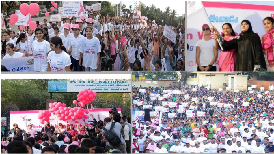
Glimpses from Pink Ribbon Walks held in Hyderabad, Warangal, Vijayawada and Visakhapatnam in October (International Breast cancer awareness month) – major cities and towns in Telangana and Andhra Pradesh (2008 - 2024)

After the Foundation introduced the innovative Pink Ribbon Walk in 2008, it is very gratifying that many NGOs and Hospitals in the region have embarked upon conducting similar programmes not only for breast cancer awareness, but for other illnesses as well, which also desperately need urgent attention. This speaks volumes of the “Pink Ribbon Campaign” that has enthused individuals, Organisations and Institutions to take up & spearhead impactful awareness activities.