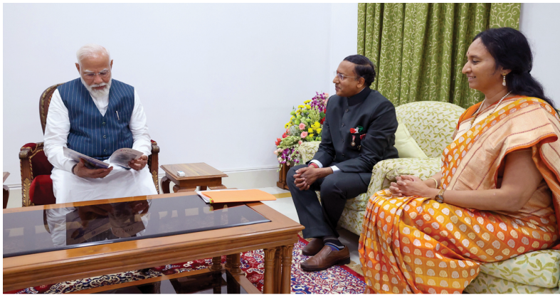
The Prime Minister autographs the editorial page of the very first quarterly issue of Pink Connexion