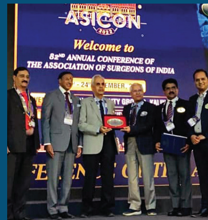
Presentation of the Oration certificate