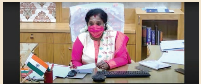
Chief Guest Dr Smt Tamilisai Soundararajan, Hon'ble Governor of Telangana

Speaking on the occasion, Telangana governor, Tamilisai Soundararajan, who was chief guest of the programme, said that she has been encouraged by UBF's inspiring Pink Ribbon campaign for over a decade. To strengthen the campaign in the state, Raj Bhavan would be illuminated in pink on the last day of October 2020, she added.