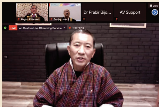
His Excellency Dr Lotay Tshering, Hon'ble PM of Bhutan

"Insight, integrity and inspiration have been the three pillars of reference in my leadership journey. Over the past 24 months, both in my role as vice-president and president ASI, I have been working to the best of my abilities to ensure creative leadership and accountable governance, which has been my "mantra". The expectations and views of "grassroot" members have been uppermost in my mind, all along. As I come to the end of my tenure, I would like to express my profound gratitude to the membership for electing me to this apex position, with an unprecedented victory margin, never before witnessed in ASI's 82-year-old history."