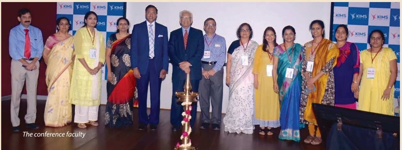
The conference faculty