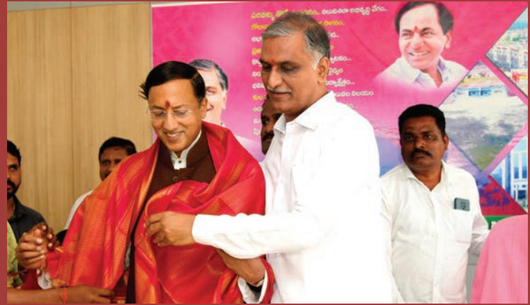
Minister Harish Rao felicitating Dr Raghu Ram

In Ibrahimpur, Dr Raghu Ram has constructed a modern crematorium, a cattle shed in the village outskirts to prevent cattle born infections, home solar system to ensure zero electricity bills for life, a digital class room, a dining hall in the school premises and an open air gym to ensure healthy living.