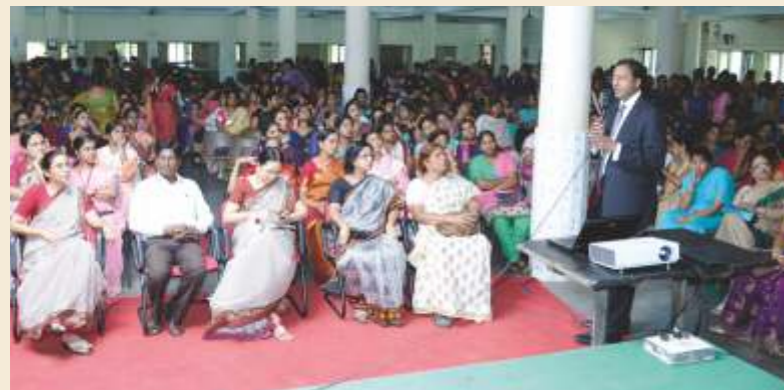
Dr Raghuram addressed nearly 600 women at the Hindustan Aeronautics Limited (HAL) on breast cancer and the importance of screening for early detection