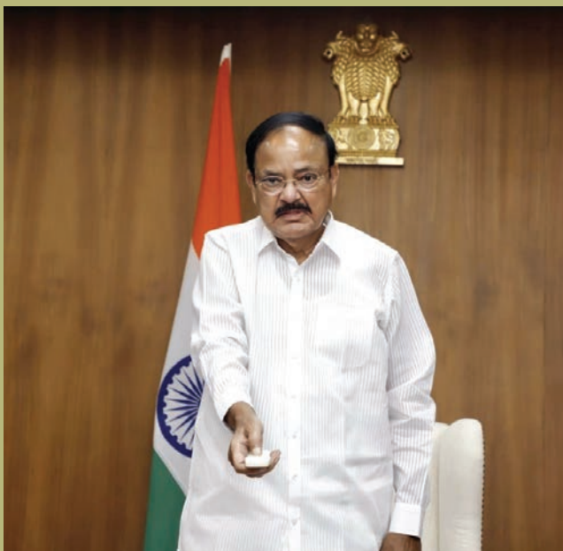
The Vice-President of India, M. Venkaiah Naidu virtually launching UBF-HELP