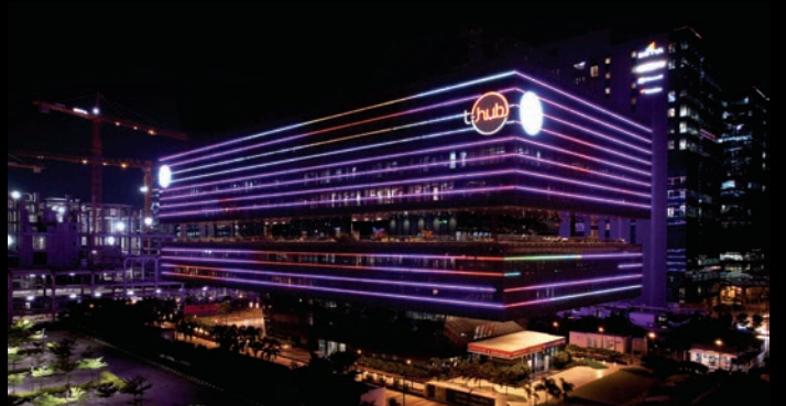
Buddha statue, Charminar, Durgam Cheruvu cable bridge, KIMS Hospitals and THub turned Pink