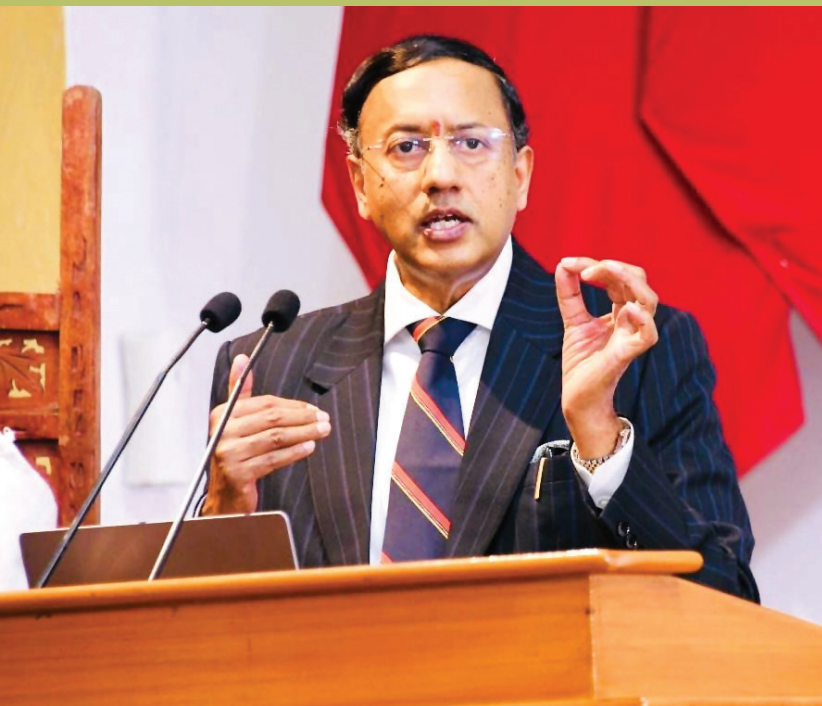
Huge gathering at MCEME auditorium