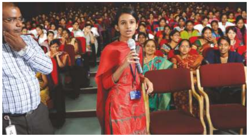
Breast cancer awareness programmes conducted at Ravindra Bharathi and the Malla Reddy Group of Institutions.