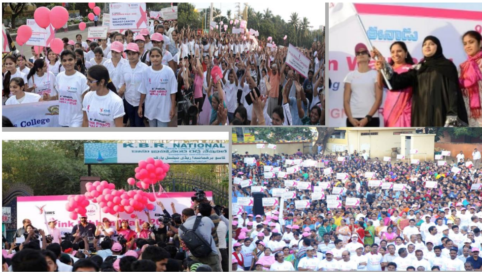
Glimpses from Pink Ribbon Walks held in Hyderabad, Warangal, Vijayawada and Visakhapatnam in October (International Breast cancer awareness month) – major cities and towns in Telangana and Andhra Pradesh (2008 - 2024)

After the Foundation introduced the innovative Pink Ribbon Walk in 2008, it is very gratifying that many NGOs and Hospitals in the region have embarked upon conducting similar programmes not only for breast cancer awareness, but for other illnesses as well, which also desperately need urgent attention. This speaks volumes of the “Pink Ribbon Campaign” that has enthused individuals, Organisations and Institutions to take up & spearhead impactful awareness activities.