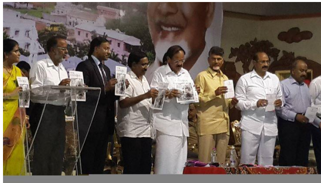
Launch of the screening programme in Andhra Pradesh by the Chief Minister, Government of Andhra Pradesh (2012)