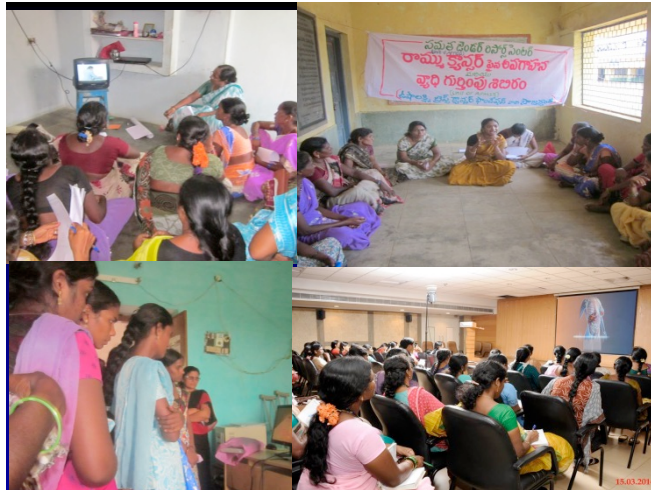
Healthcare workers training & women being educated in the Village Community Centre

This milestone project made national impact in 2016 and a high-powered Steering Committee and Technical Advisory Group (TAG) set up by the Government of India's Union Ministry of Health, of which he was a member, approved the proposal to implement CBE based Breast cancer Screening Programme all over India. This initiative is currently being rolled out nationwide.