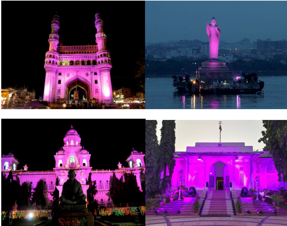
'Paint the City Pink Campaign' (October) - Charminar, Buddha statue, Legislative Assembly, United States of America Consulate, Raj Bhavan & many other prominent buildings in Hyderabad illuminated in PINK during International Breast cancer awareness month (2010 – 2024)

Inspired by this impactful decade long campaign, the Hon'ble Governor of Telangana gave permission to the Foundation to illuminate Raj Bhavan in Pink annually since October 2020. Hyderabad is the only city in Asia pacific region where several monuments and historic buildings have been lit up in pink annually, consistently for ten consecutive years.